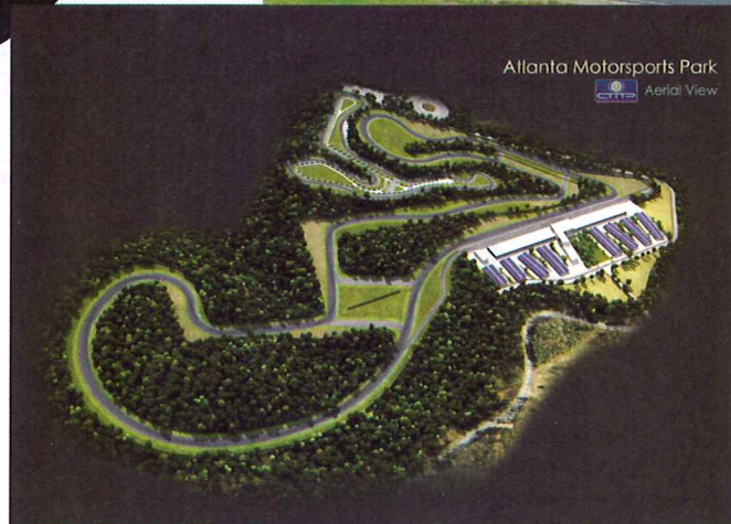
Atlanta Motorsports Park Aerial View