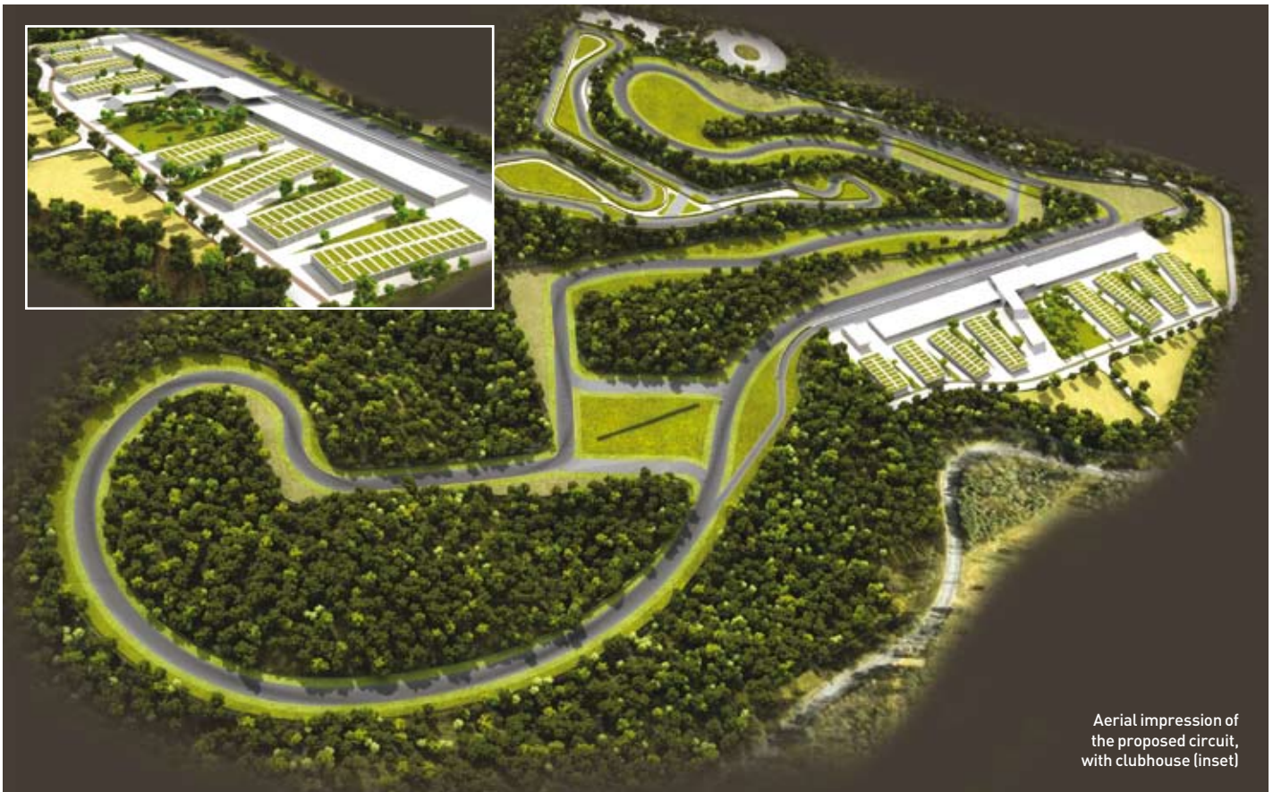
Aerial impression of the proposed circuit, with clubhouse (inset)

rewarded three new members that evening with a private helicopter airlift to see the Dawsonville site from above.