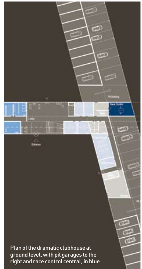
Plan of the dramatic clubhouse at ground level, with pit garages to the right and race control central, in blue